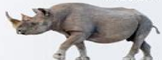
West African Black Rhinoceros