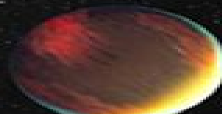
HD 209458 B