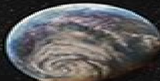
GLIESE 581 D