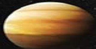
51 PEGASE B