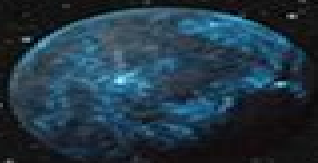
GJ 1214 B