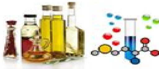
Food application (production of vinegar, oil, edible coatings, and bioactive compounds)