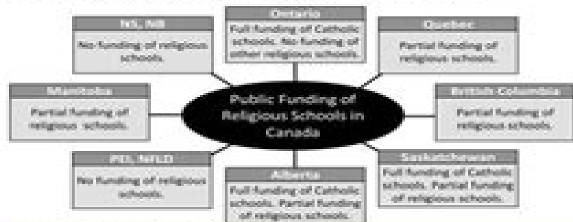
Figure 1: Status of Faith-Based Funding Across Canada

When it comes to education policy, why is a revision of Catholic school public funding necessary in Saskatchewan? Three policy alternatives are presented to contest this problem, concluding with our policy recommendation.