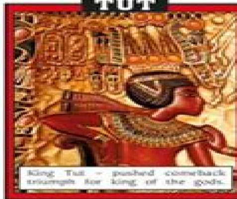
King Tut - pushed comeback triumph for king of the gods.

Tut Tut, 9, announced the togethery turn-around after high-level discussions with palace advisors. "Amun is now top god again, and his shrines and statues will be making a