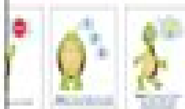
Step 5: Tuck from your chest and take three deep breaths