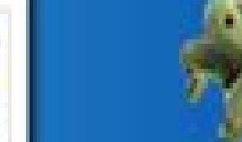
Step 6: Come out when you feel calm and free of a bad day