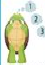
Step 3: Tuck from your chest and take three deep breaths