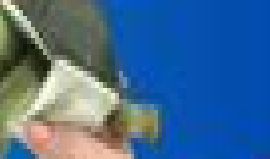
Step 3: Tuck inside your shell and take three deep breaths