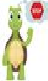
Step 2: Stop your body