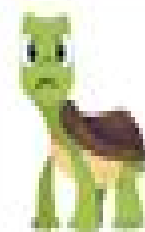
Step 1: Recognize your feelings