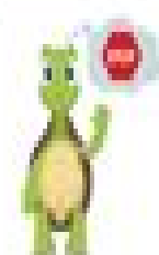
Step 2: Stop your body