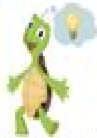
Step 4: Come out when you feel calm and free of a bad day