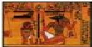
Bakenshat in the underworld, yesterday.

Tomb boxes were unavailable for comment.