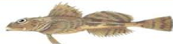
Myoxocephalus octodecemspinois (longhorn sculpin)