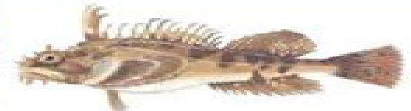
Hemitripterus americanus (sea raven)