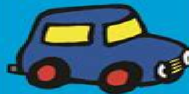
car el auto