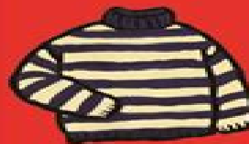
sweater el suéter