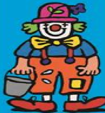
down el payaso

A bilingual introduction to words, numbers, shapes, and colors