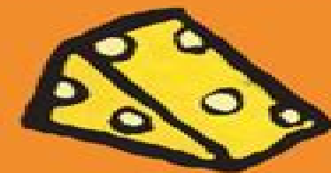
cheese el queso