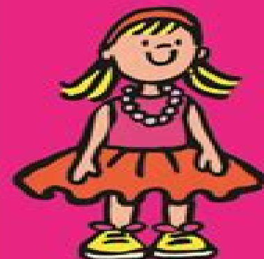
girl la niña