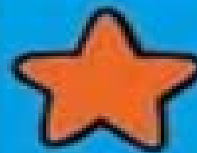
star an réalta