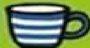
cup an cupán