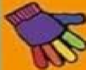
glove an mhionóg