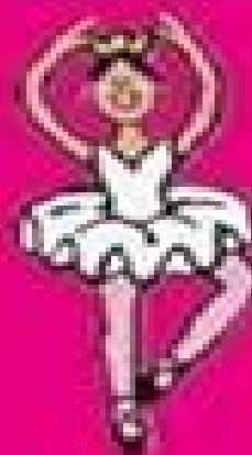
ballerina an bailleánaí