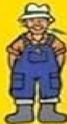
farmer an feirmeoir

A bilingual introduction to words, numbers, shapes and colours