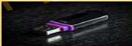
PMC Flash Memory