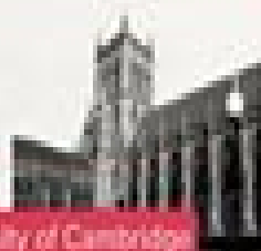
University of Cambridge