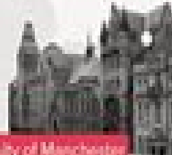
University of Manchester