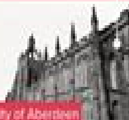
University of Aberdeen