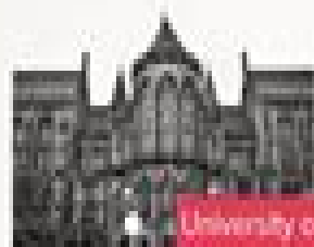
University of Glasgow