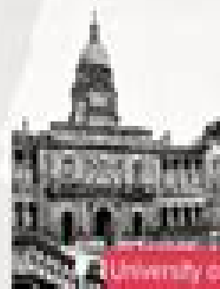
University of Edinburgh