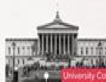
University College London