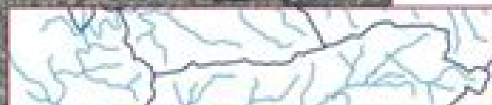
Streams and Watersheds