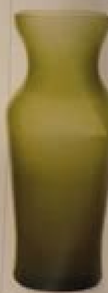
Tall, slender, faceted glass vase with a green hue and a faceted design. Height: 100 cm. Width: 10 cm. Weight: 1.5 kg. Price: $1,200.00.