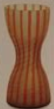
Small, rounded, faceted glass vase with a red and blue design. Height: 50 cm. Width: 5 cm. Weight: 0.5 kg. Price: $400.00.