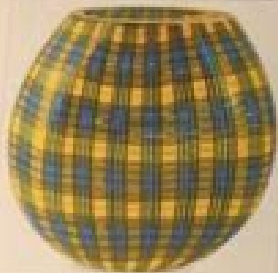
Large, rounded, faceted glass vase with a yellow and blue plaid pattern. Height: 150 cm. Width: 15 cm. Weight: 3.0 kg. Price: $2,400.00.