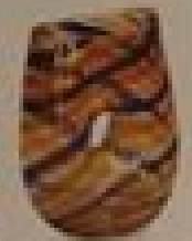
Small, rounded, faceted glass vase with a red and blue design. Height: 50 cm. Width: 5 cm. Weight: 0.5 kg. Price: $400.00.