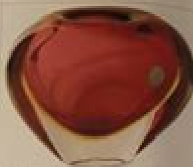
Large, rounded, faceted glass vase with a red hue and a faceted design. Height: 150 cm. Width: 15 cm. Weight: 3.0 kg. Price: $2,400.00.