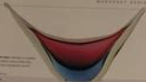
Large, rounded, faceted glass vase with a red and blue design. Height: 150 cm. Width: 15 cm. Weight: 3.0 kg. Price: $2,400.00.