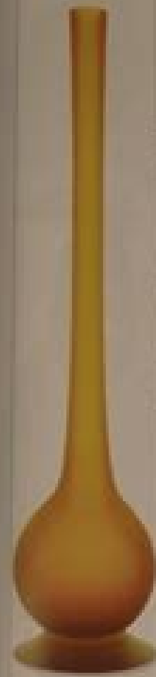
Tall, slender, faceted glass vase with a yellow hue and a faceted design. Height: 100 cm. Width: 10 cm. Weight: 1.5 kg. Price: $1,200.00.