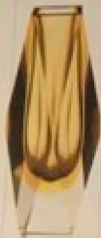
Faceted glass vase with a golden-yellow hue and a faceted design. Height: 100 cm. Width: 10 cm. Weight: 1.5 kg. Price: $1,200.00.