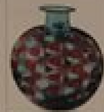
Small, rounded, faceted glass vase with a red and blue design. Height: 50 cm. Width: 5 cm. Weight: 0.5 kg. Price: $400.00.