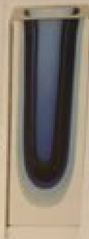
Faceted glass vase with a blue hue and a faceted design. Height: 100 cm. Width: 10 cm. Weight: 1.5 kg. Price: $1,200.00.