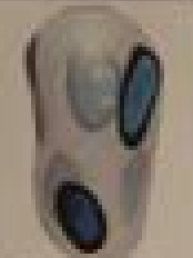
Small, rounded, faceted glass vase with a red and blue design. Height: 50 cm. Width: 5 cm. Weight: 0.5 kg. Price: $400.00.