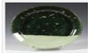
Alligator & Pistachio