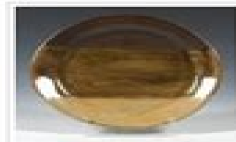
Black Walnut & Polished Pebbles