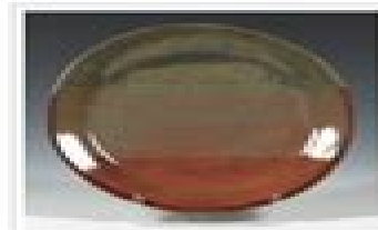
Smoke & Speckled Plum