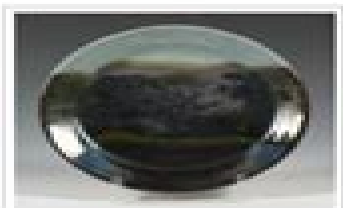
Black Ice & Frost Blue