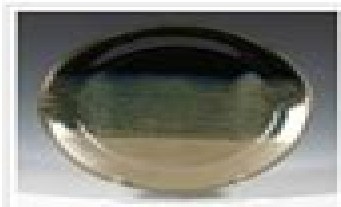
Silver Sage & Northern Woods