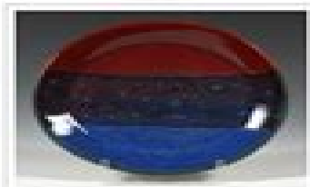
Cinnabar & Blue Surf