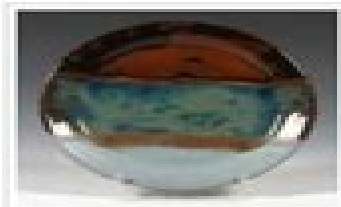
Copper Adventurine & Frost Blue