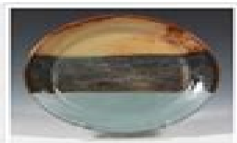
Maycoshino & Frost Blue