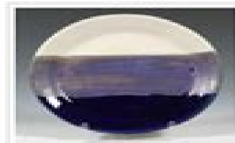
Alabaster & Sapphire