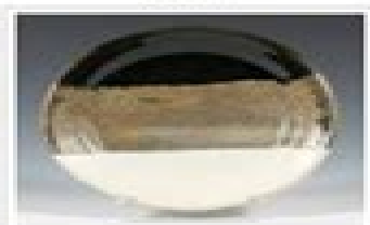
Northern Woods & Alabaster