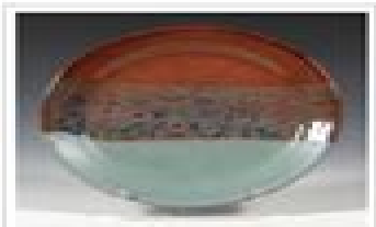
Speckled Plum & Frost Blue