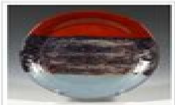
Cinnabar & Frost Blue