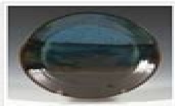
Black Walnut & Stoned Denim