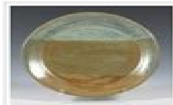
Olivine & Green Tea