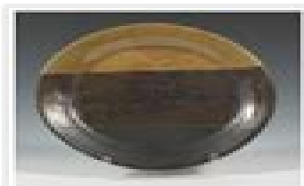
Wrought Iron & Olivine