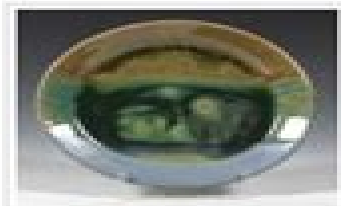
Malachite & Frost Blue