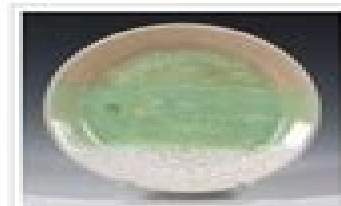
Patina & White Cobblestone