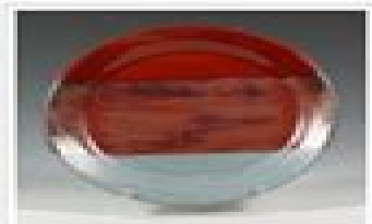
Frost Blue & Cinnabar