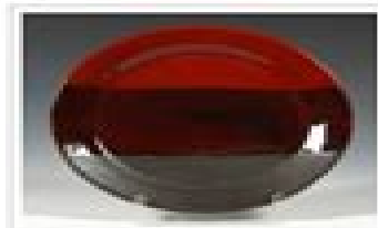
Cinnabar & Wrought Iron