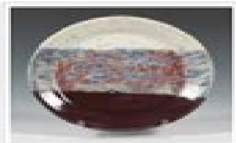
Sea Salt & Purple Mint