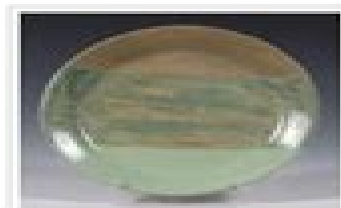
Pistachio & Silver Sage