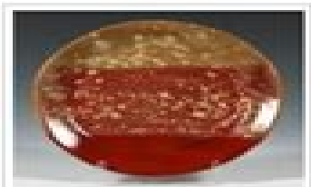
Honeycomb & Cinnabar