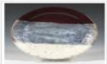
Purple Mint & Sea Salt