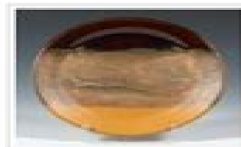
Root Beer & Rustle Wash