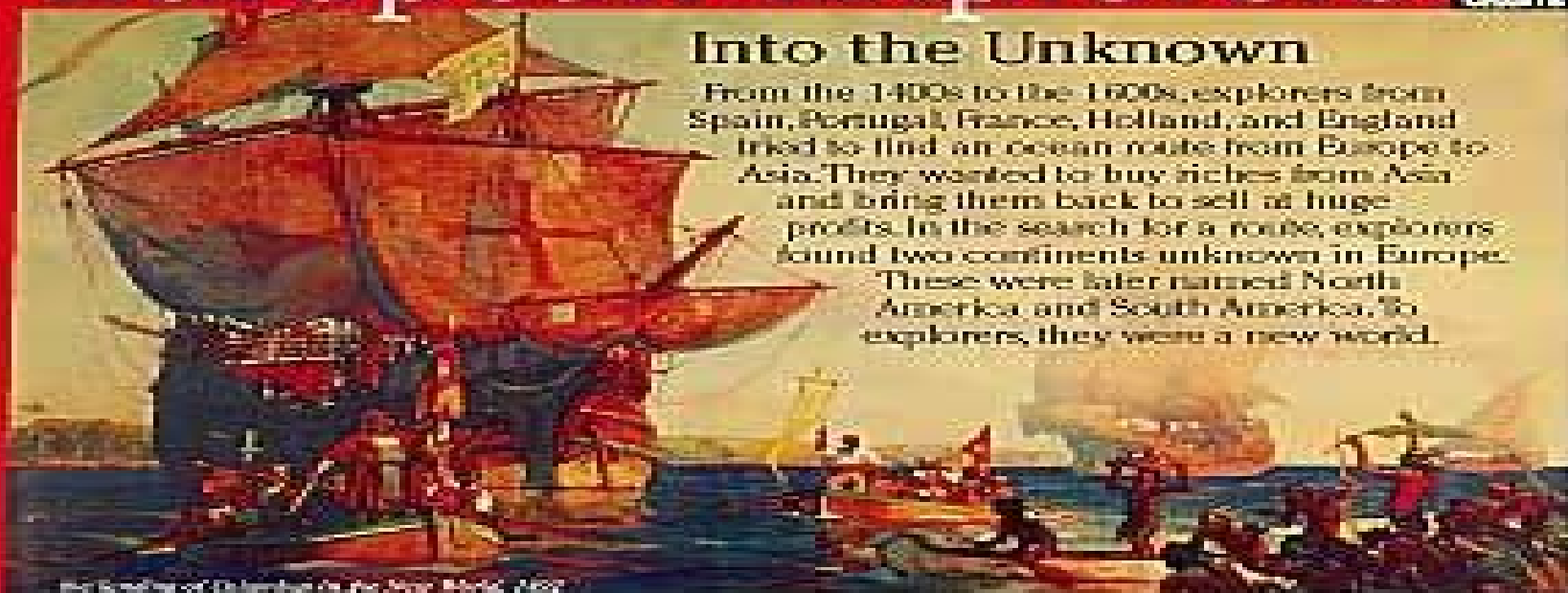
Reproduction of Columbus's ship, Santa Maria, 1492