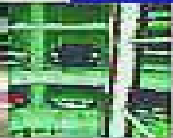
THYATRAK AUTOMATED PARKING SYSTEM IN THEATRE PARKING LOT IN THEATRE PARKING LOT