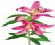
PINK SPOTTED LILY