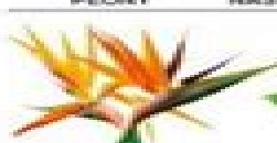
BIRD OF PARADISE