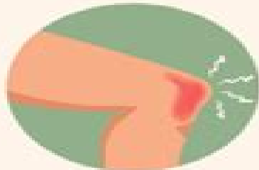
Giving herself intentional bruises