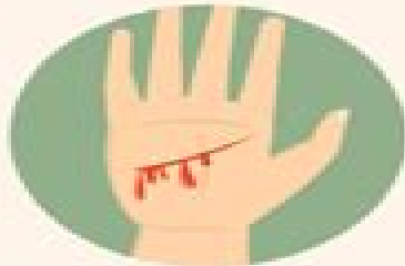
Punching, scratching, or pinching herself