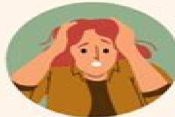
Pulling out her hair, eyelashes, or eyebrows