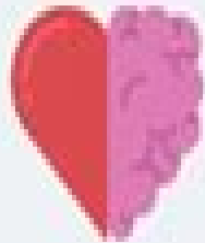
Emotional & Mental Health