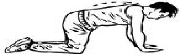
Cat and Camel