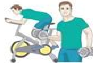
Consistent Exercise Weights + Cardio