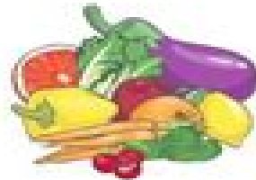
Eating Veggies with Every Meal