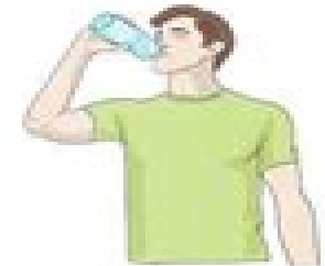
Monitoring Your Hydration