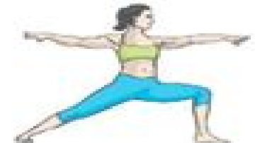
Daily Stretching/ Mobility