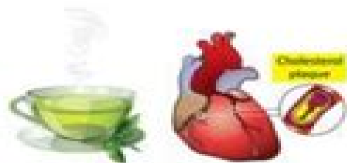
Green Tea for High Cholesterol