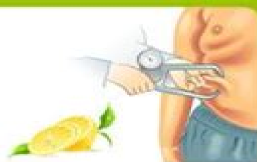
Lemon for Obesity