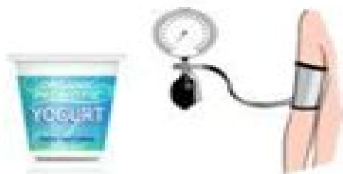
Yogurt for High Blood Pressure