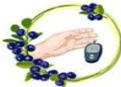
Blueberries for Diabetes