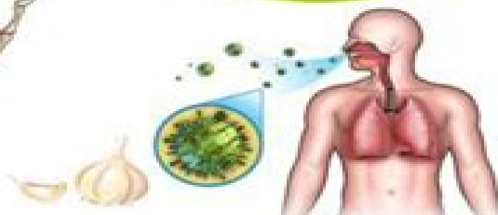
Garlic for Weak Immunity