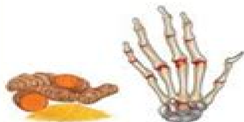
Turmeric for Arthritis