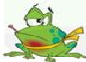
a sore throat