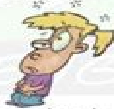
a stomachache (US) a stomach ache (Brit)