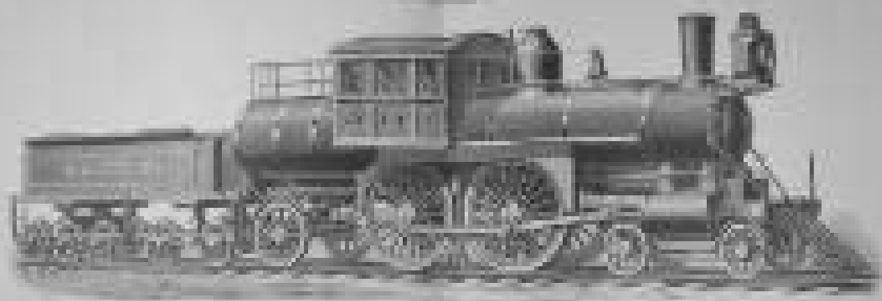
THE MICHIGAN CENTRAL RAILROAD, DETROIT, MICHIGAN, 1894. THE GREAT PORTLAND CEMENT RAILROAD, DETROIT, MICHIGAN, 1894.