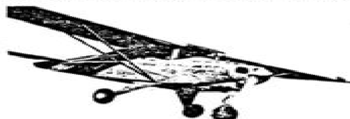
Fig. A2.31 Piper Tri-Pacer

The metal covered cantilever wing with its better overall aerodynamic efficiency and sufficient torsional rigidity has practically replaced the externally braced wing except for low speed commercial or private pilot aircraft as illustrated by the aircraft in Figs. A2.31 and 32. The wing covering is usually fabric and therefore a drag truss inside the wing is necessary to resist loads in the drag truss direction. Figs. A2.33 and 34 show the general structural layout of such wings. The two spars or beams are metal or wood. Instead of using double wires in each drag truss bay, a single diagonal strut capable of taking either tension or compressive loads could be used. The external brace struts are stream line tubes.