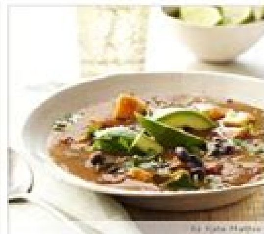
By Kate Hutton

Think of this plan, packed with skin-nourishing nutrients, as your blueprint for a younger-looking complexion. We kept tabs on calories so that as you unveil a more youthful appearance, you also can shed up to 10 pounds in four weeks. (Staying at an ideal weight will help prevent the wrinkles and sag that can come from breaking down skin fibers if you keep losing and regaining.) Choose any breakfast (about 300 calories), lunch (400), or dinner (500), and have up to two snacks (125 calories each) every day. For chocolate treats that meet our caloric guidelines, see page 208.