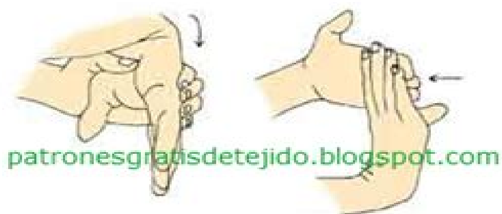
Estiramiento de muñeca