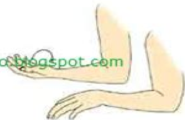
Pronación y supinación del antebrazo