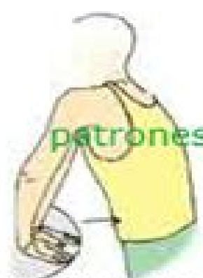
Flexión del tramo de muñeca