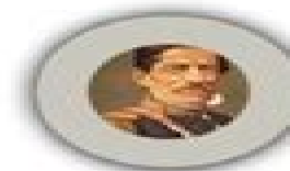
JOSÉ BALTA 1868-1872