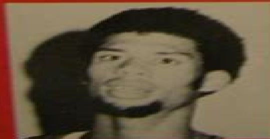
Kareem Abdul Jabbar