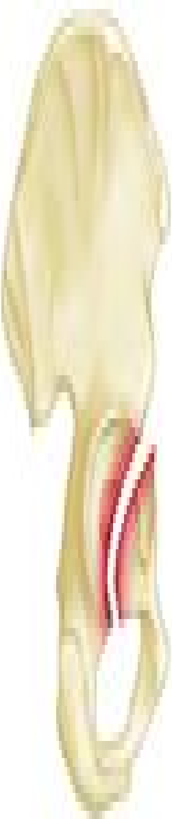
Anterior wall fracture