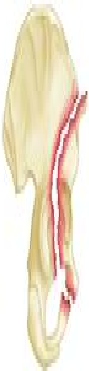
Anterior column fracture