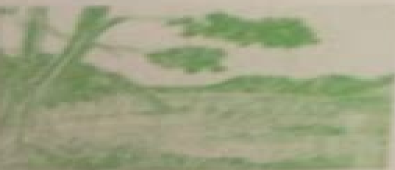
THE GULF ISLANDS