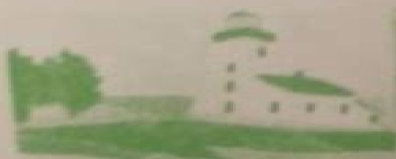
EAST POINT LIGHTHOUSE