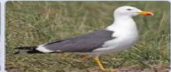
Lesser Black-backed Gull

Characteristics: Largest gull in Britain, black back and wings, white head and underparts, yellow bill