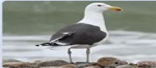
Great Black-backed Gull

Characteristics: Large size, pale gray back and wings, pink legs, yellow bill with red spot