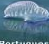
Portuguese Man o' War