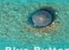
Blue Button Jellyfish