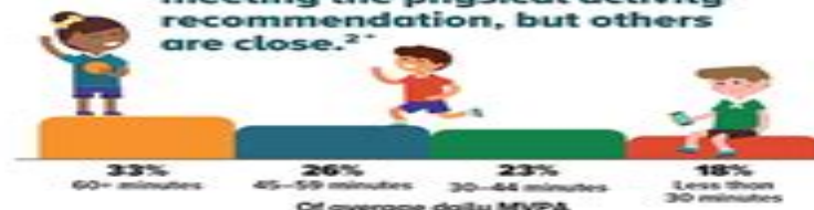
Of average daily MVPA

Only one third of kids are meeting the physical activity recommendation, but others are close. 2*