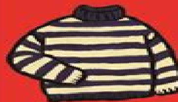
sweater el suéter