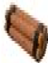
Alfred Nobel invents Dynamite