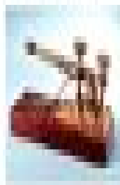
Samuel Morse invents the Telegraph