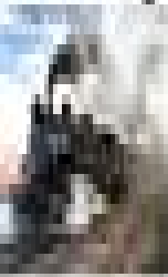
James Watt invents the Steam Engine