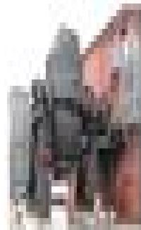
The Bessemer Method of Processing Steel is founded