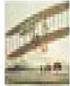
Oliver and Wilbur Wright invent the first plane