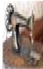
Elias Howe invents the Sewing Machine