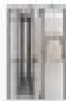
Elisha Otis invents the Elevator Safety Break