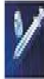
Louis Pasteur discovers vaccines