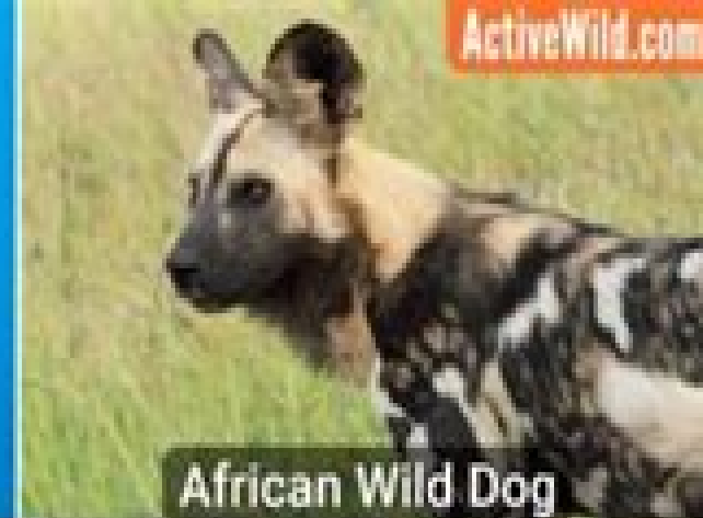
African Wild Dog