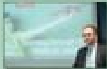
YEC of the World member speaking at a podium.

YECs of the World is a community of entrepreneurs who are passionate about their work and committed to helping others succeed. The network is a global community of entrepreneurs who are passionate about their work and committed to helping others succeed.