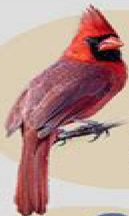
Sparrows & Finches 23%