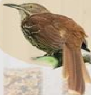
Mockingbirds & Thrashers 10%