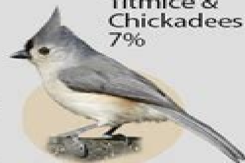
Titmice & Chickadees 7%