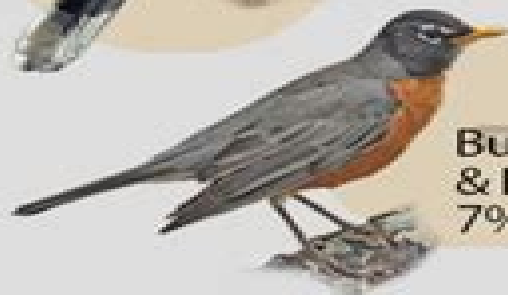
Buebirds & Robins 7%