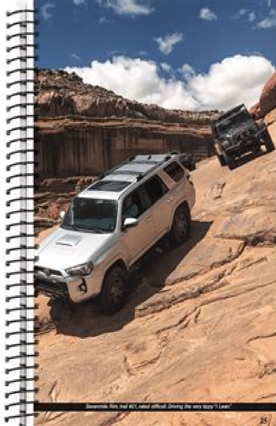
Sevenmile Rim trail 4x4 rated difficult (bring the very best "U" Levers!)

Note: As of this writing, a new BLM Travel Management Plan was under way. Future changes or closures of some trails in this area are possible.