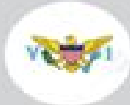
U.S. VIRGIN ISLANDS