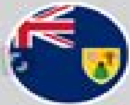
TURKS AND CAICOS ISLANDS