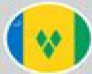
SAINT VINCENT AND THE GRENADINES