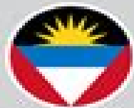
ANTIGUA AND BARBUDA