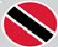
TRINIDAD AND TOBAGO