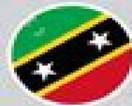
SAINT KITTS AND NEVIS