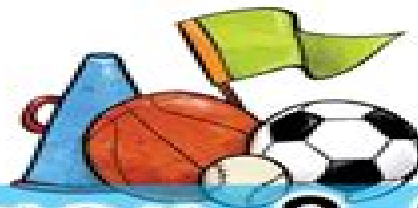
Being a Good Sport