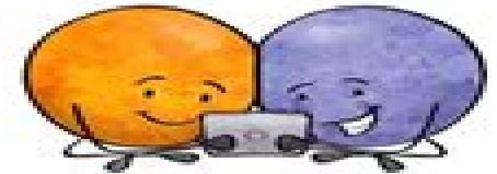
Working with Others