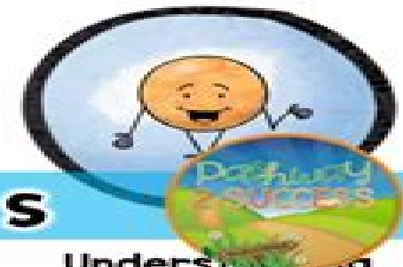
Understanding Personal Space