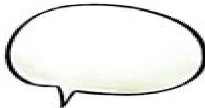
Using Polite Words