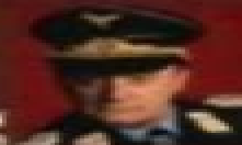
ROBERT VAUGHN as Erhard Milch