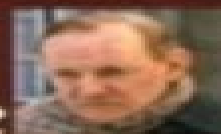
TREVOR HOWARD as Heinrich Tessenow