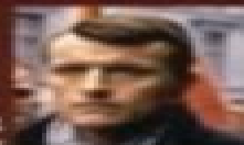
RUFUS HAUER as Albert Speer