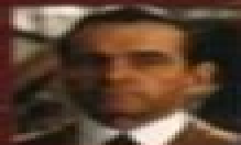
IAN HOLM as Josef Goebbels