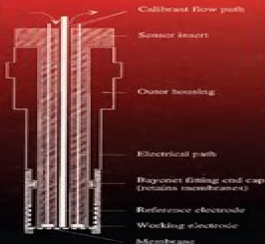
In-situ process biosensor