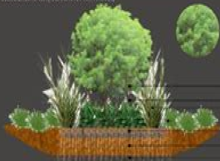
SECTIONAL DETAIL (DRAWN BY AUTHOR)