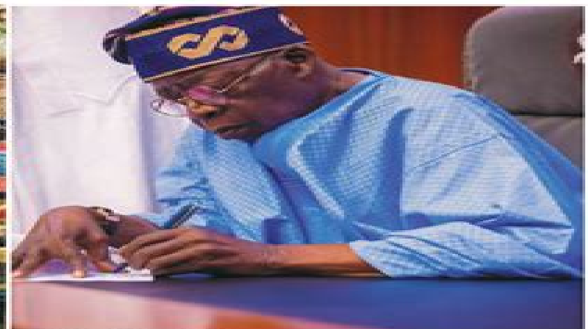
President Bola Ahmed Tinubu