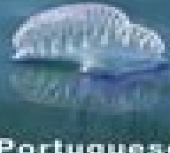
Portuguese Man o' War