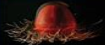
Big Red Jellyfish