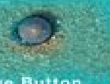
Blue Button Jellyfish