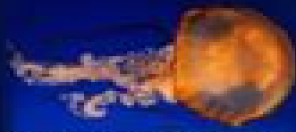
Pacific Sea Nettle