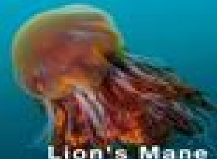
Lion's Mane Jellyfish